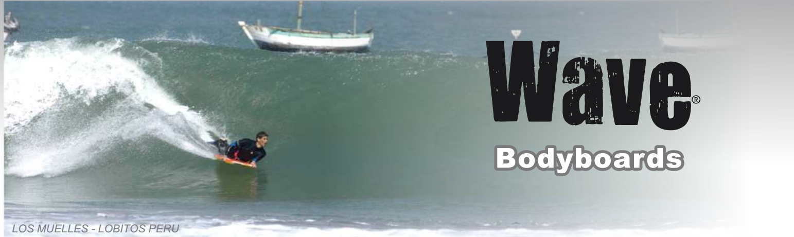
LOS MUELLES - LOBITOS PERU